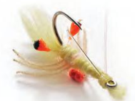
Christmas Sand Prawn

All guests must have a comprehensive medical emergency evacuation insurance policy, as well as travel insurance policy to cover them for the duration of the trip. It is the right of the live-aboard service provider to cancel any booking without refund, if the client is not adequately insured. In this case, adequate insurance means: an insurance that covers emergency medical evacuation from the scene of the illness or accident, to the nearest best hospital and then back to your hometown. Cancellation and curtailment insurance cover is also recommended. Furthermore all guests will be required to sign and return the Reservation and Indemnity Form prior to the trip.