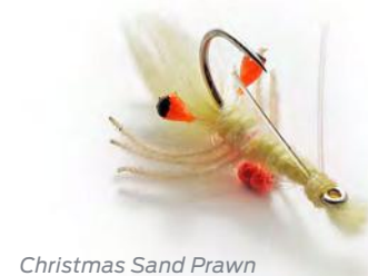
Christmas Sand Prawn