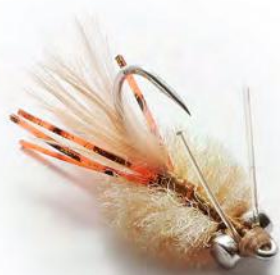
Marabou Fleeing Crab